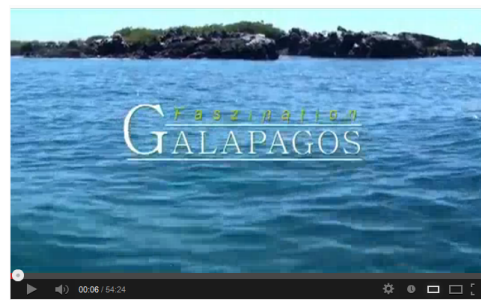
Wonders of the Galapagos HD | Nature Documentary