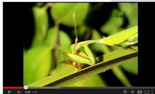
Nature's Perfect Predators- Praying Mantis