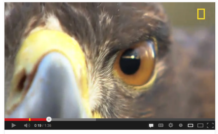
🔇 Golden Eagle vs. Jackrabbit