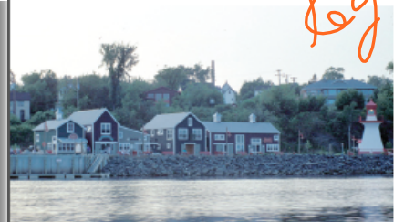
Ritchie Wharf Park is a popular tourism destination for those visiting Miramichi, New Brunswick.