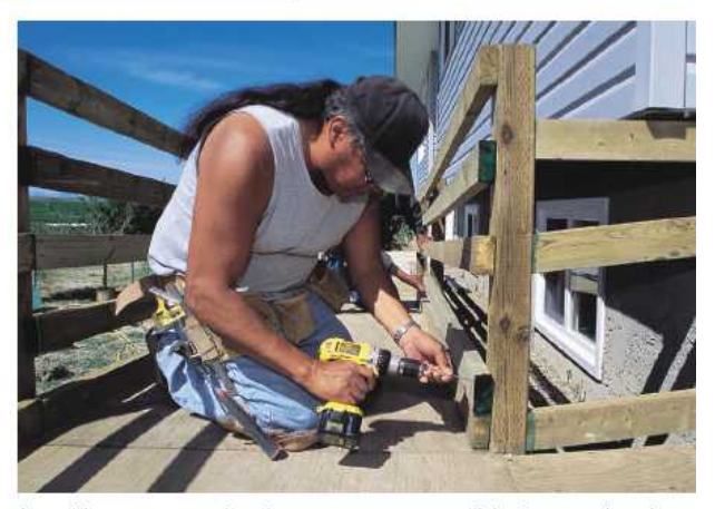
Installing ramps makes homes more accessible for people who use wheelchairs.