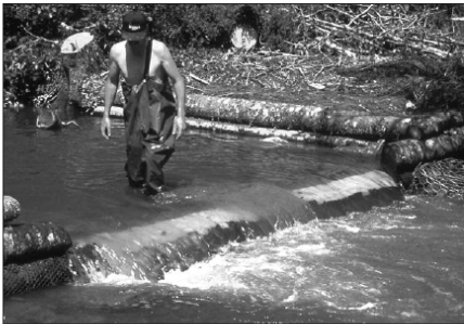
Digger Log being placed in a stream

Small to medium sized logs placed in streams to create plunge pools. They are intended for small streams only.