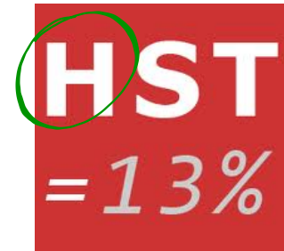
Harmonized Sales Tax