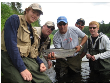
MVHS Fly Fishing Club