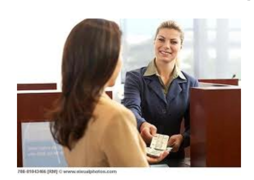
banking that is done with the help of a Teller