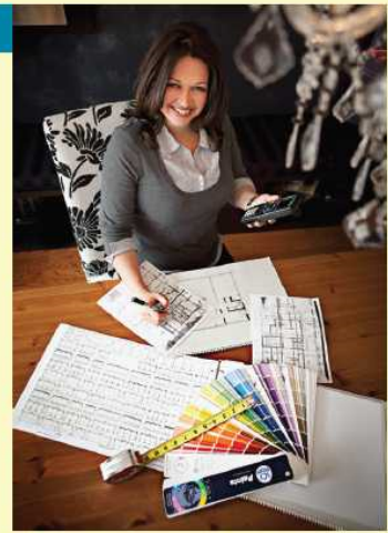
Andrea's job involves artfully and tastefully combining colours.

A self-employed entrepreneur might take out a loan to help start up a new business and cover the costs of materials and equipment. If Andrea took out a loan to help cover her costs she would need to calculate the total cost of the loan with interest. This would help her keep track of her expenses. If Andrea took out a loan of $20 000.00 and repaid it by making 12 monthly payments of $1698.43, what would be the total cost of her loan?