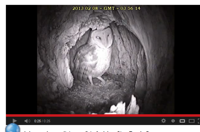
inside barn owl regurgitates a pellet - Audubon Starr Ranch, Ca.