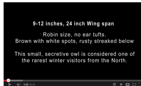
oreal Owl - Visitor From The North