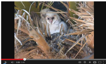
aby owl ejects pellet