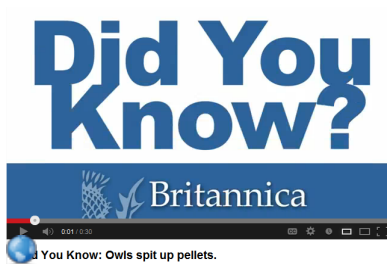
You Know: Owls spit up pellets.