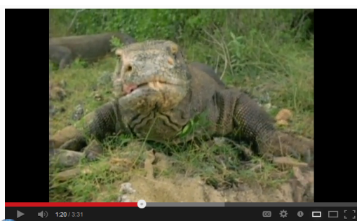
Nature's Perfect Predators - Komodo Dragon