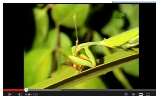
Nature's Perfect Predators- Praying Mantis