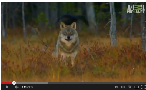
Viking Wilderness - Wolves and Bears Clash