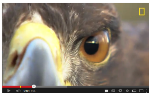
Golden Eagle vs. Jackrabbit