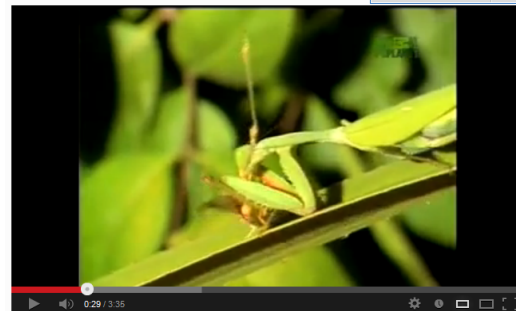
Nature's Perfect Predators- Praying Mantis