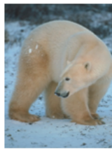
Northern Coniferous Forest or Taiga