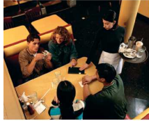
Servers often share tips with kitchen staff.

People who work in restaurants usually earn some of their income in the form of tips, often paid in addition to the minimum wage. Because many people's first jobs are as servers, this is an important type of income to understand. Many people also make a lifelong career in the restaurant industry. Consider the following questions about income from tips.