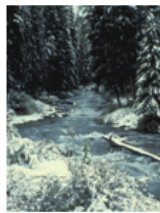
Northern Coniferous Forest or Taiga