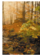
Temperate Deciduous Forest