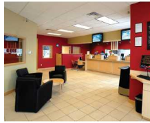
Employees at your local bank can help you choose the bank account that best meets your needs.

T In this activity, you will work with a partner to research and compare banking services.