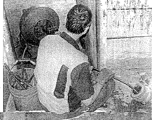
One of a plumber's tasks is to remove roots from drains with a snake.