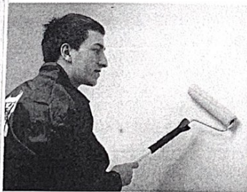
House painting is a job that high school and college students may do over the summer months.