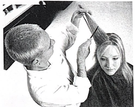
This apprentice hairstylist is learning to cut and style hair at a community college.